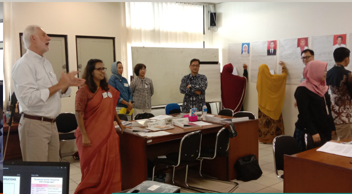
face to face meeting