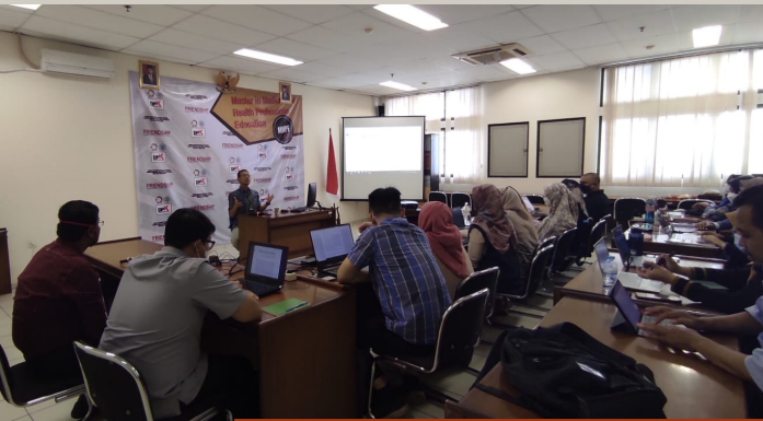
face to face meeting